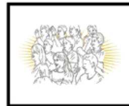
Roo Disaster Lambda print on metallic paper 120 x 38 cm 2005

For Martine Corompt, animation is a core foundation of her work. Drawing on the temporal and conceptual dimensions of animation, Corompt's work pushes its language to make comments on the role of representation and identity in a global period. Over the past 10 years, Corompt's exploration of caricature, anthropomorphism, and iconography has taken many forms.